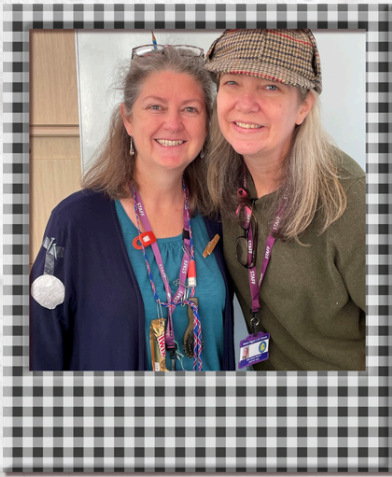
Resourceful & Sleuth